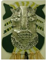
African Benin Mask